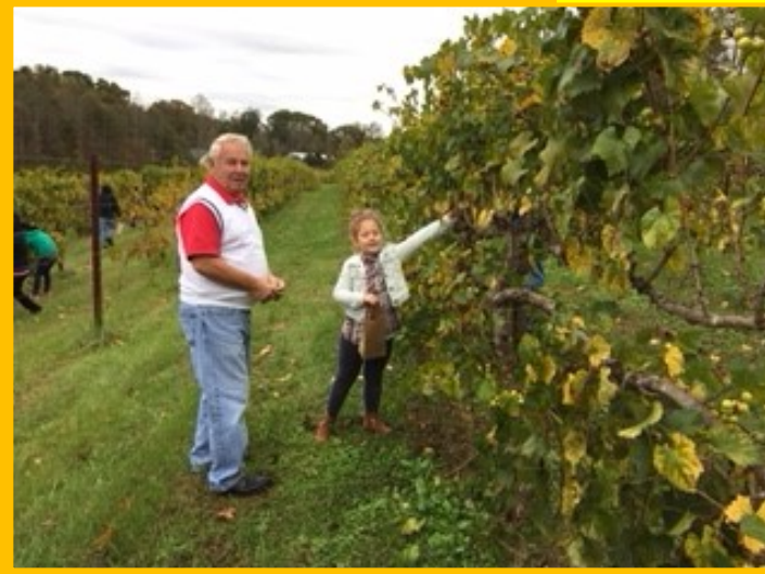
Picking grapes in the vineyard.